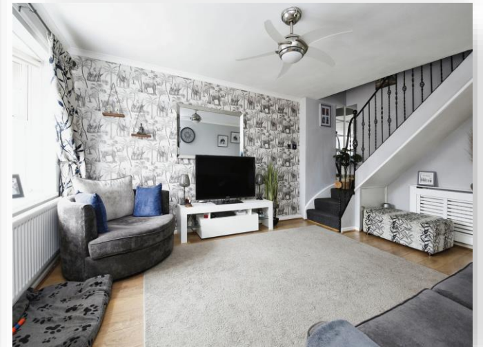
Wainwright Close, HARTLEPOOL TS25 1XB