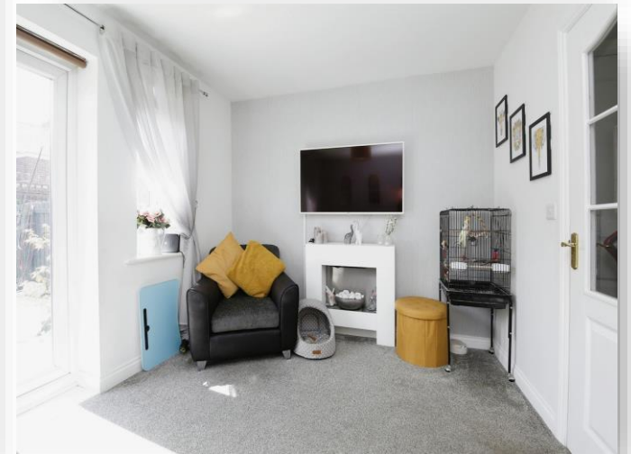
Larpool Close, HARTLEPOOL TS26 8GA