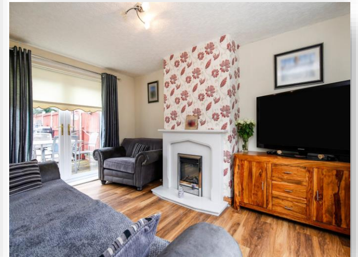
Iber Grove, HARTLEPOOL TS25 3HH