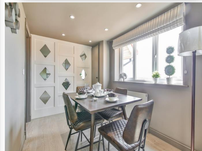
Mansion House, Fleet Avenue Hartlepool TS24 0WN