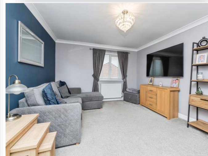
North Park, Billingham TS23 3SU