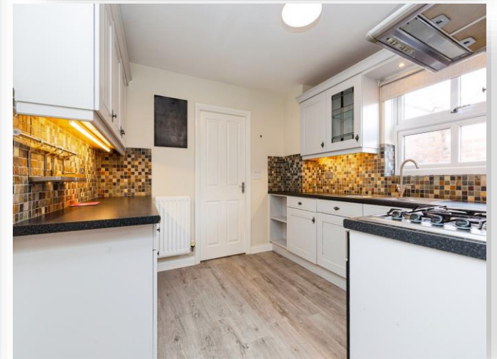
The Stables, Wynyard, Billingham, TS22 5SG