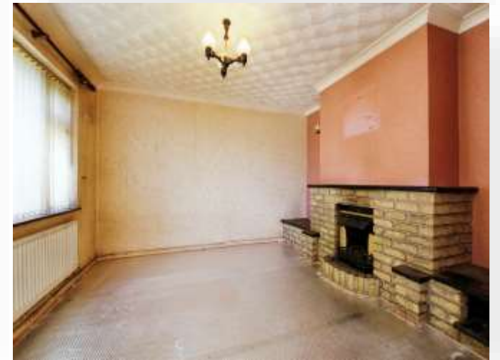
Finchale Avenue, Billingham, TS23 2EB