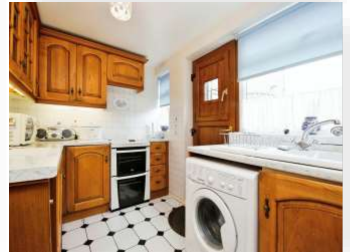
Wynyard Road, Wolviston, Billingham, TS22 5LQ