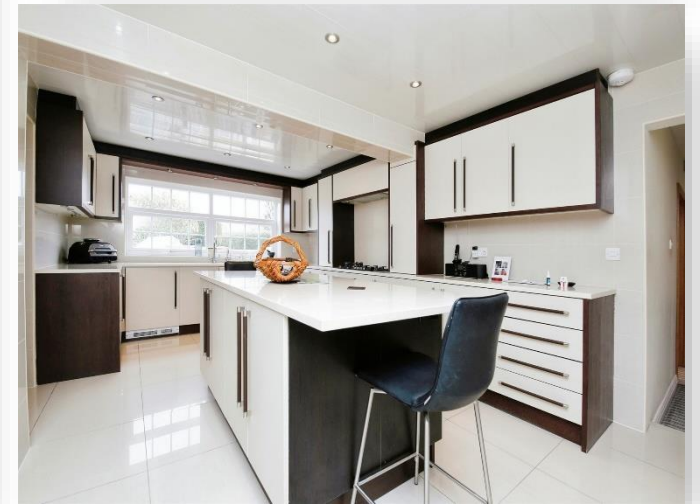
Humber Grove, Billingham, TS22 5EE