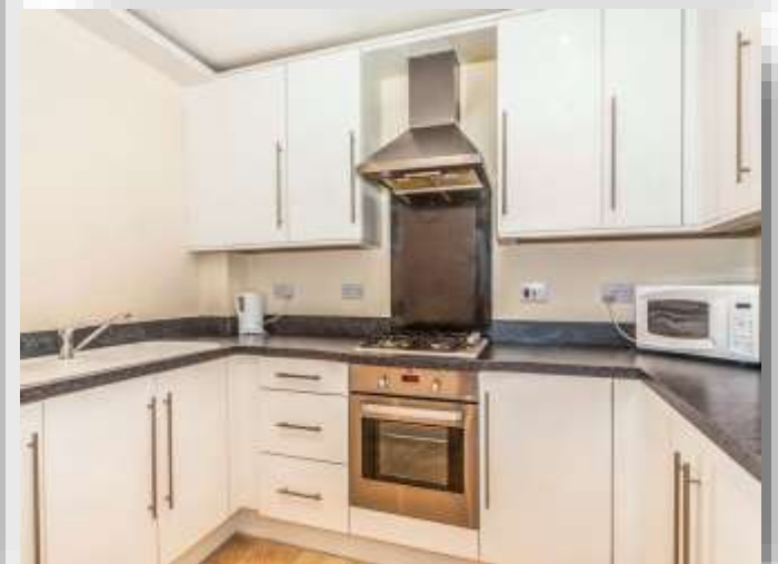
Woodend Court, The Wynd, Wynyard, Billingham, TS22 5TZ