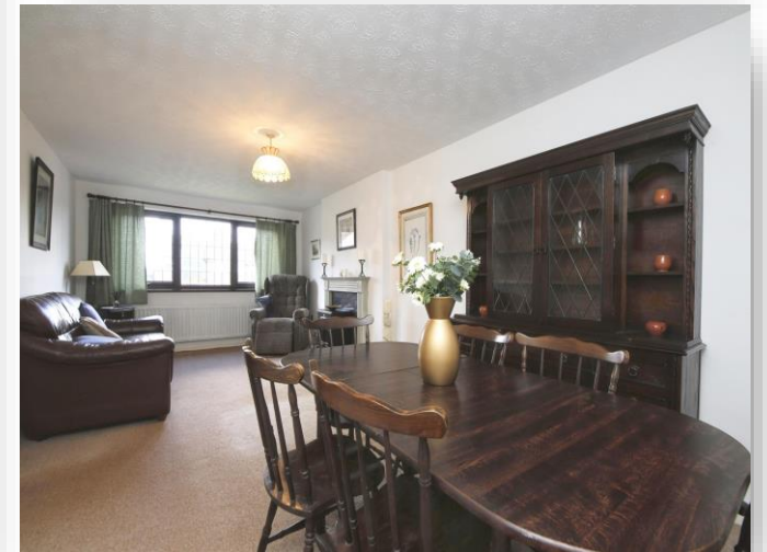
St. Davids Close, Billingham TS23 2PD