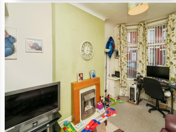
Rufford Road, Wallasey, CH44 4BY