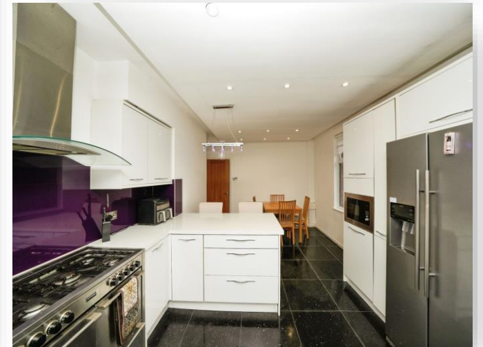
Ormond Street, Wallasey, CH45 4LP