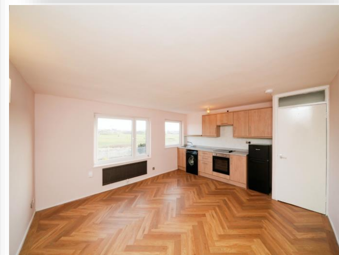
The Channel, Burbo Way, Wallasey, CH45 3NU