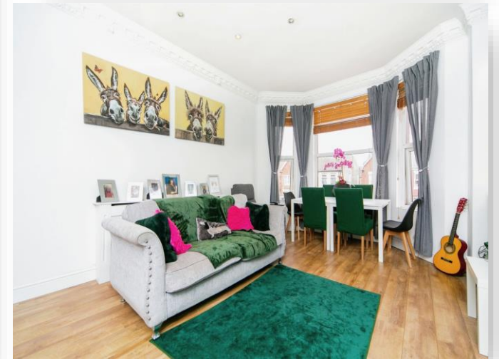
Serpentine Road, WALLASEY, CH44 0AT