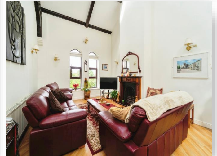
Manor Mews, WALLASEY, CH45 7HH