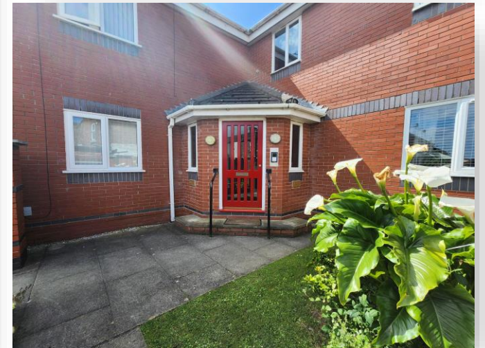
Victoria Parade, WALLASEY, CH45 2PH