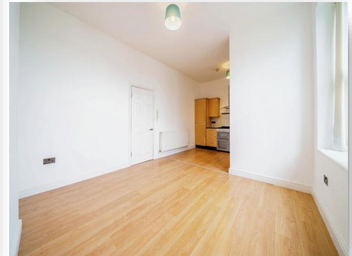
St. James Road, Wallasey, CH45 9LS