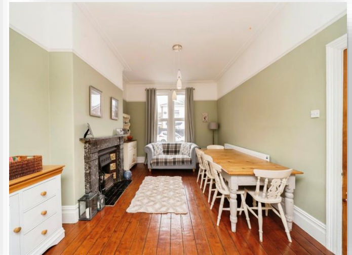
Westmoreland Road, Wallasey, CH45 1HU