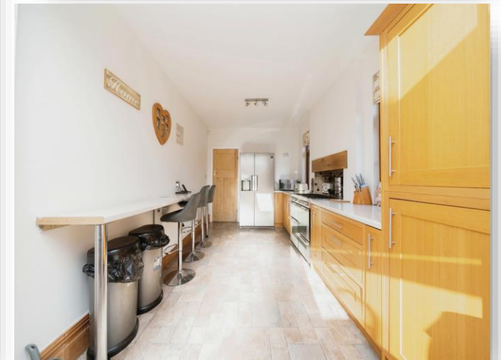
Uppingham Road, Wallasey, CH44 2BT