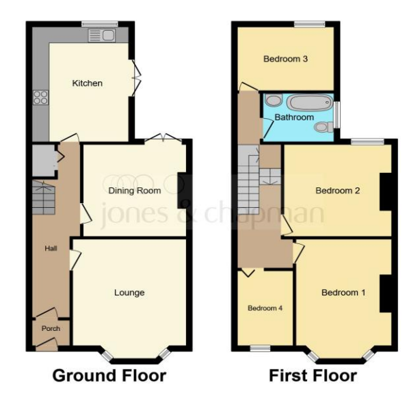
This floorplan is for illustrative purposes only and is not drawn to scale. Measurements, floor-areas, openings and orientations are approximate. They should not be relied upon for any purpose and do not form any part of an agreement. No liability is taken for any error or mis-statement. All parties must rely on their own inspections.