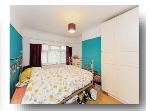
view this property online jonesandchapman.co.uk/Property/WAL109210