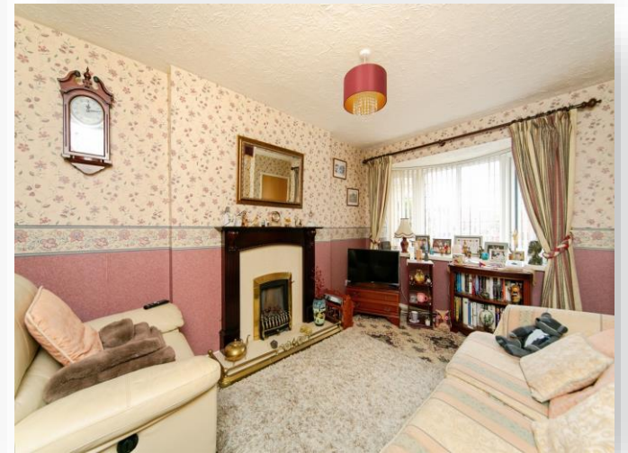
Oakwood Drive, Prenton, CH43 7NX