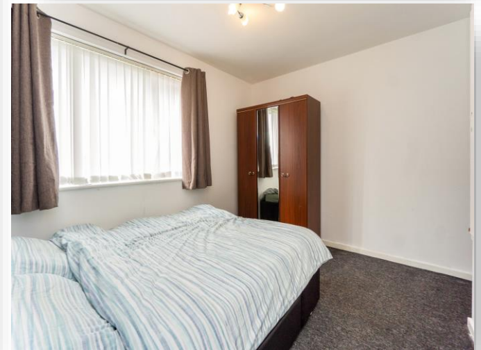
Birchwood Avenue, Birkenhead, CH41 3RT