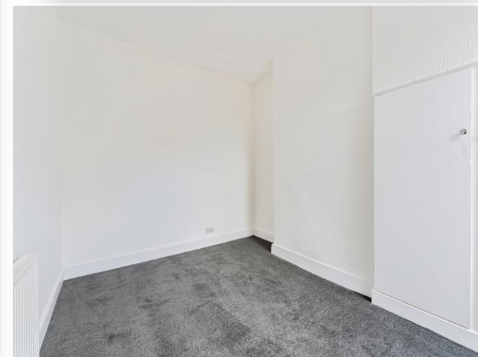
Rodney Street, Birkenhead, CH41 2SD