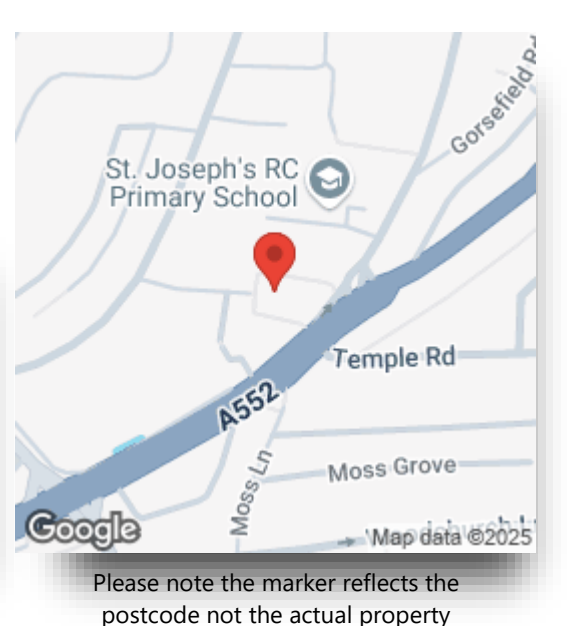
view this property online jonesandchapman.co.uk/Property/PTN116031