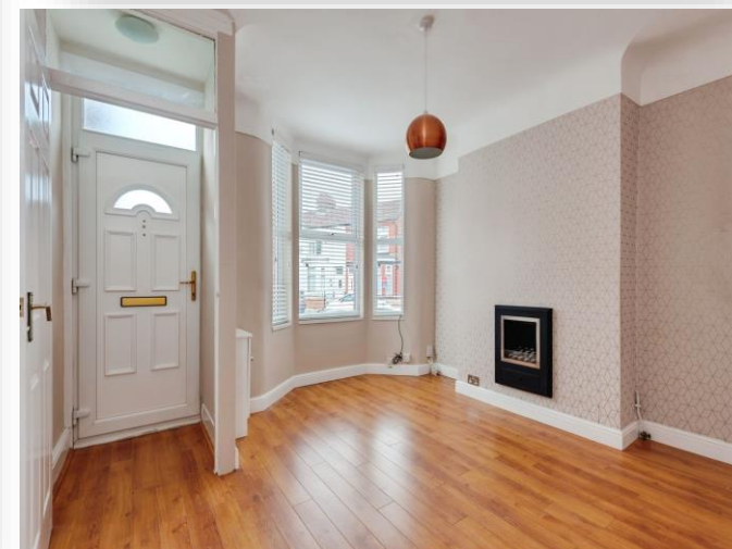
Thornton Street, Birkenhead, CH41 0BE