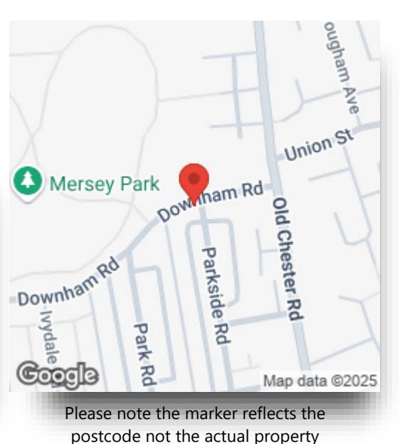
view this property online jonesandchapman.co.uk/Property/PTN116062