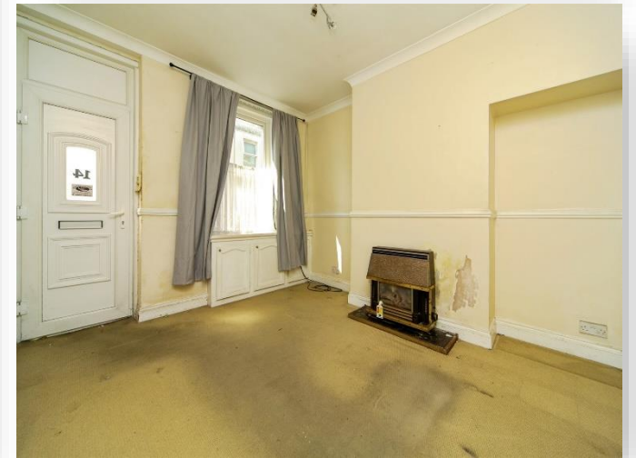
Menai Street, Birkenhead, CH41 6EL