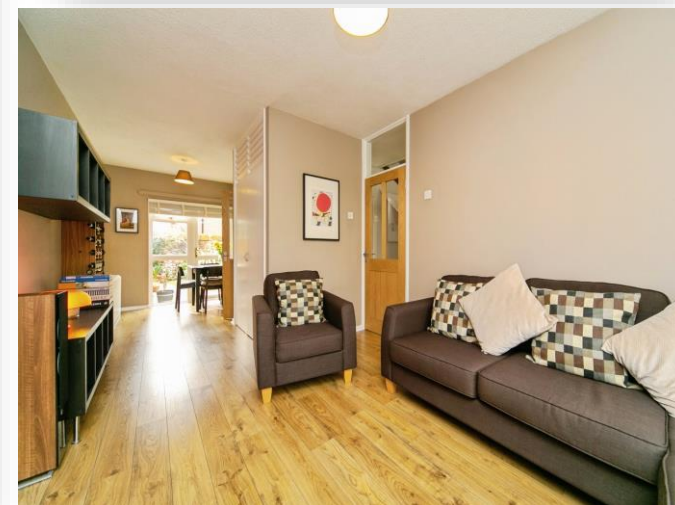
Morris Court, Bidston Road, Prenton, CH43 6XG