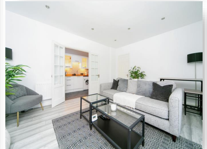
Grange Court, Holm Lane, Prenton, CH43 2NT