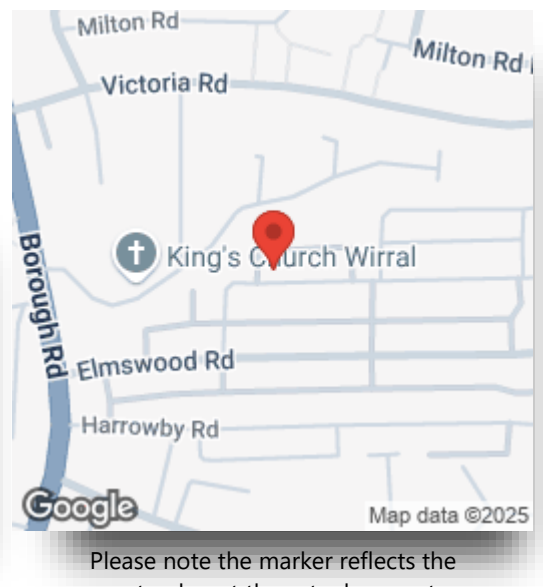
postcode not the actual property