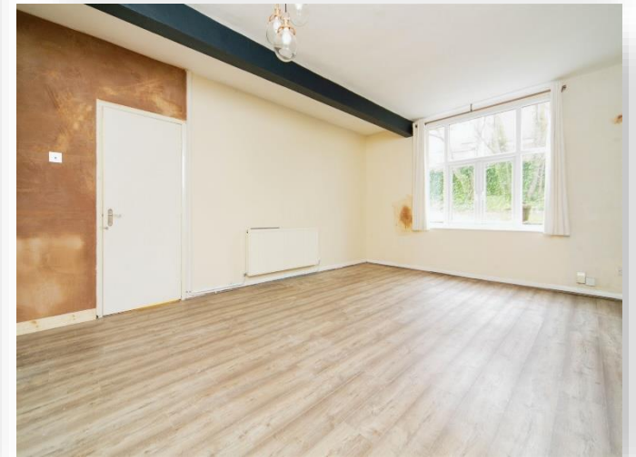
Caroline Place, Prenton, CH43 1TR