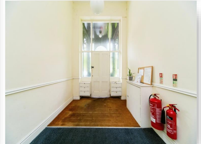
Caroline Place, Oxton, Prenton, CH43 1TR