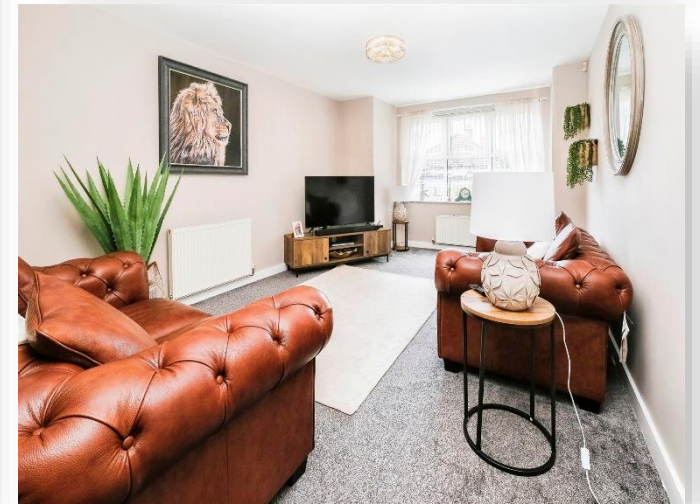
Oriel Court, Prenton Lane, Birkenhead, CH42 8LB