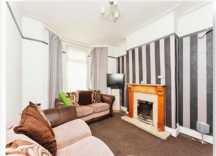
Highfield Grove, Rock Ferry, Birkenhead, CH42 2DQ