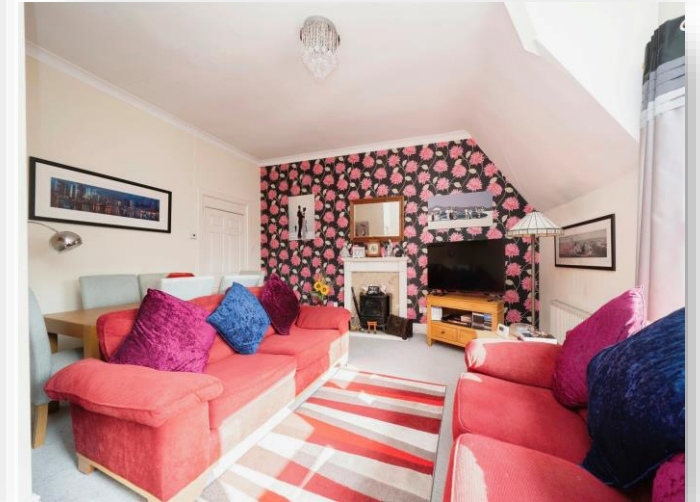
South Court, Wexford Road, Prenton, CH43 9TD