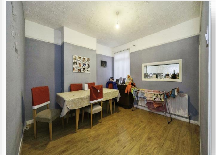
Ivydale Road, Birkenhead, CH42 5PS