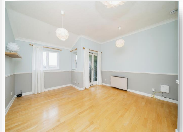
Priory Wharf, Birkenhead, CH41 5LD