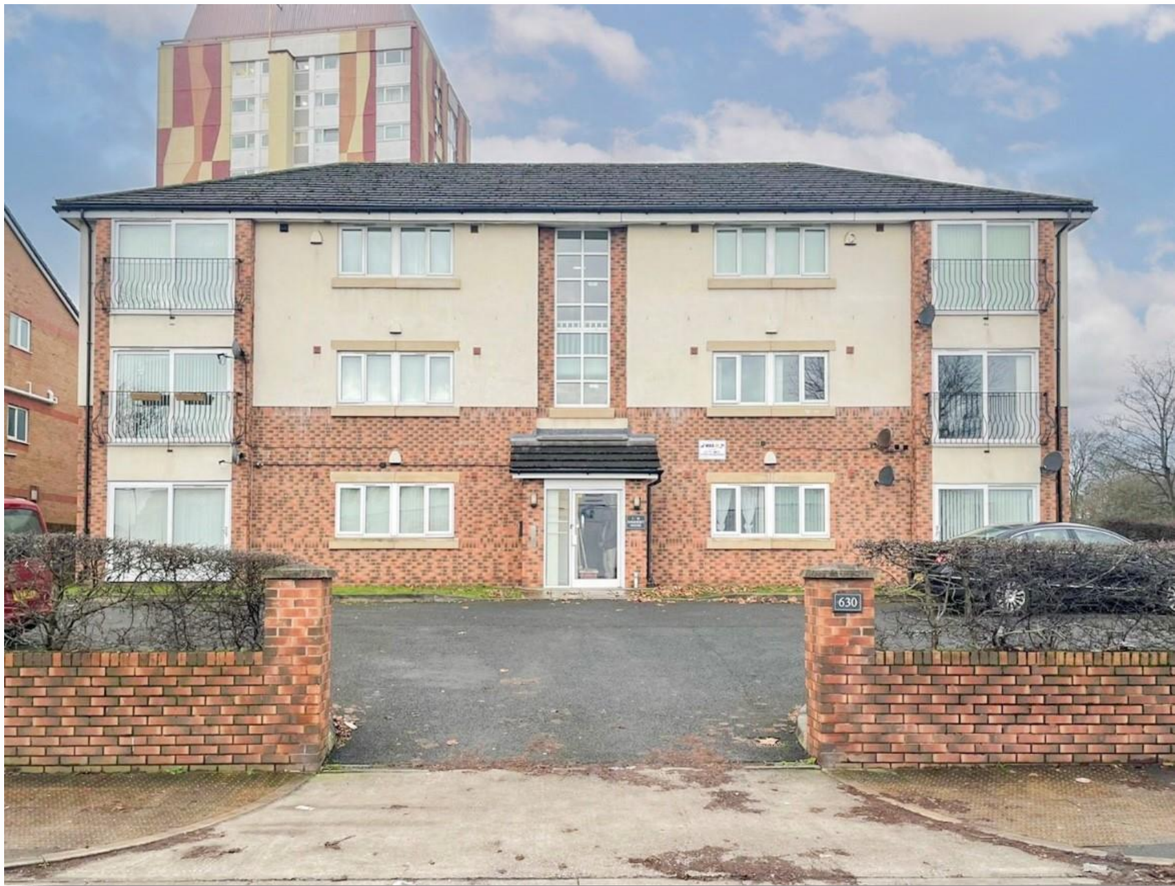
Somerset House, New Chester Road, Birkenhead CH42 1QB