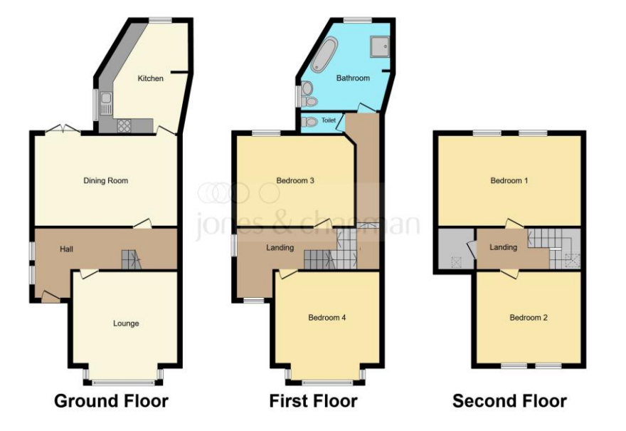
This floorplan is for illustrative purposes only and is not drawn to scale. Measurements, floor-areas, openings and orientations are approximate. They should not be relied upon for any purpose and do not form any part of an agreement. No liability is taken for any error or mis-statement. All parties must rely on their own inspections.