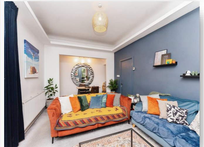
Rock Lane East, Birkenhead, CH42 1PG