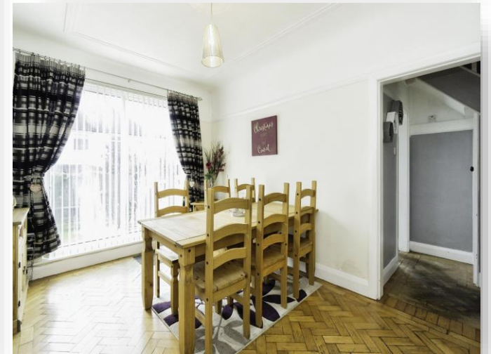
Mallory Road, Birkenhead, CH42 6QR