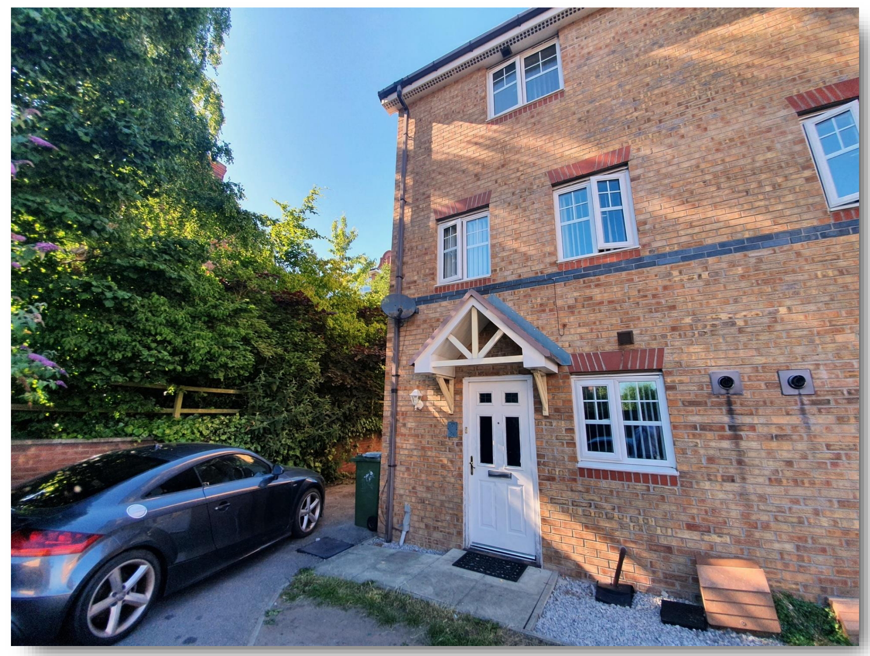
Merlin Road, Birkenhead, CH42 9QG