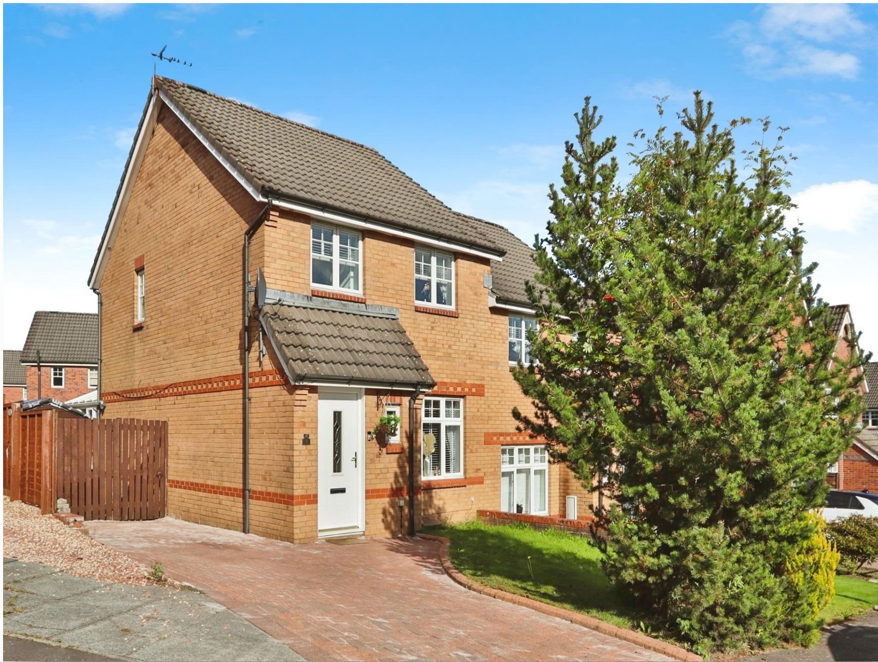
Waterhaughs Place, Glasgow G33 1RT