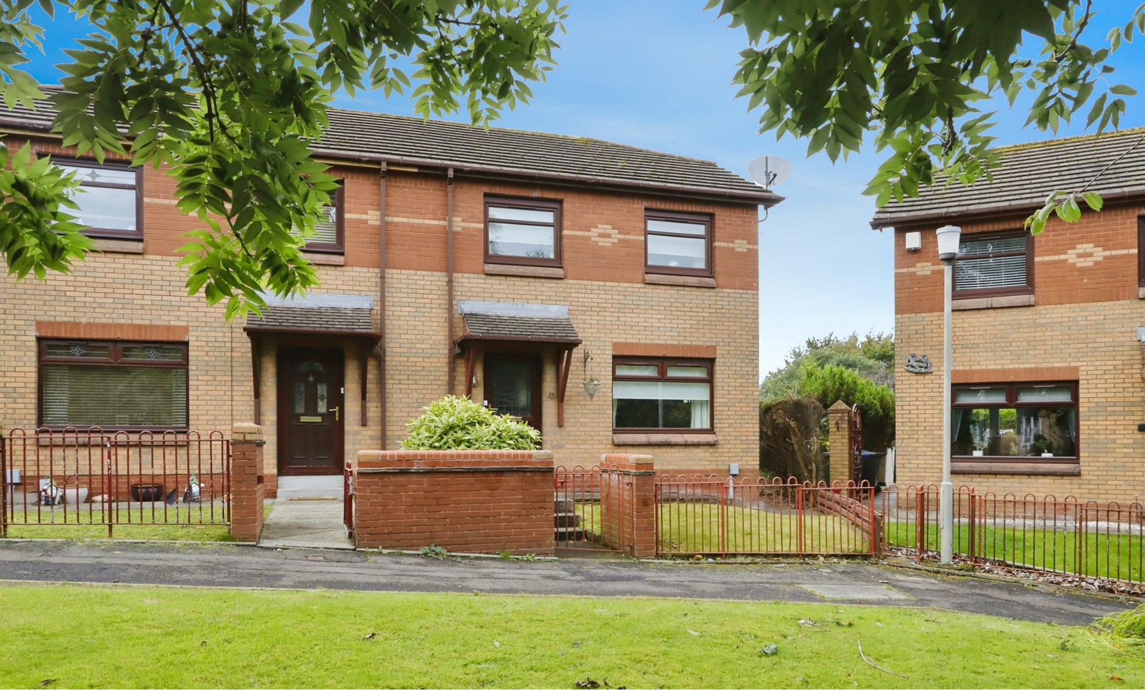
Southloch Gardens, Glasgow G21 4AR