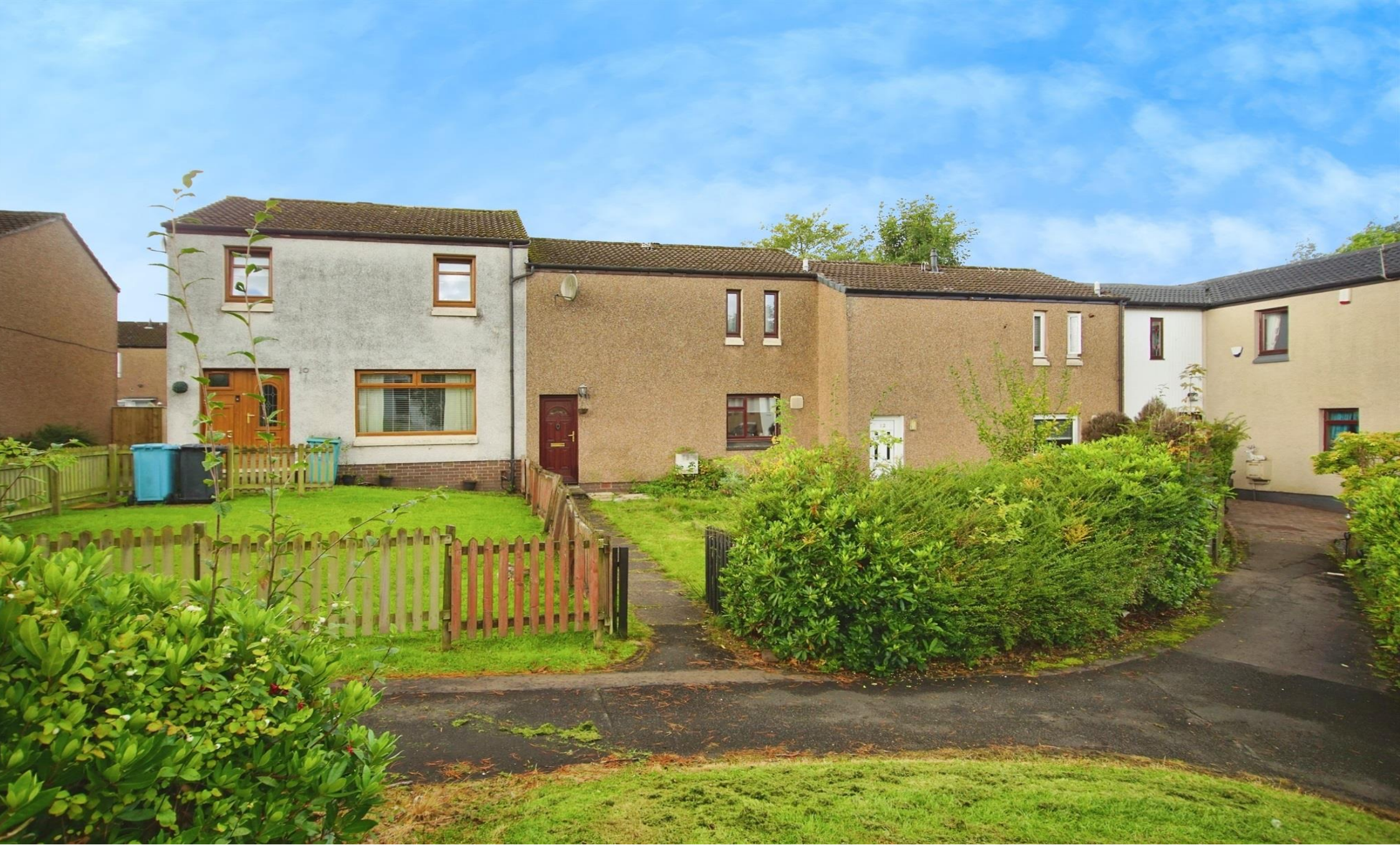
Netherwood Court, Cumbernauld Glasgow G68 9LN