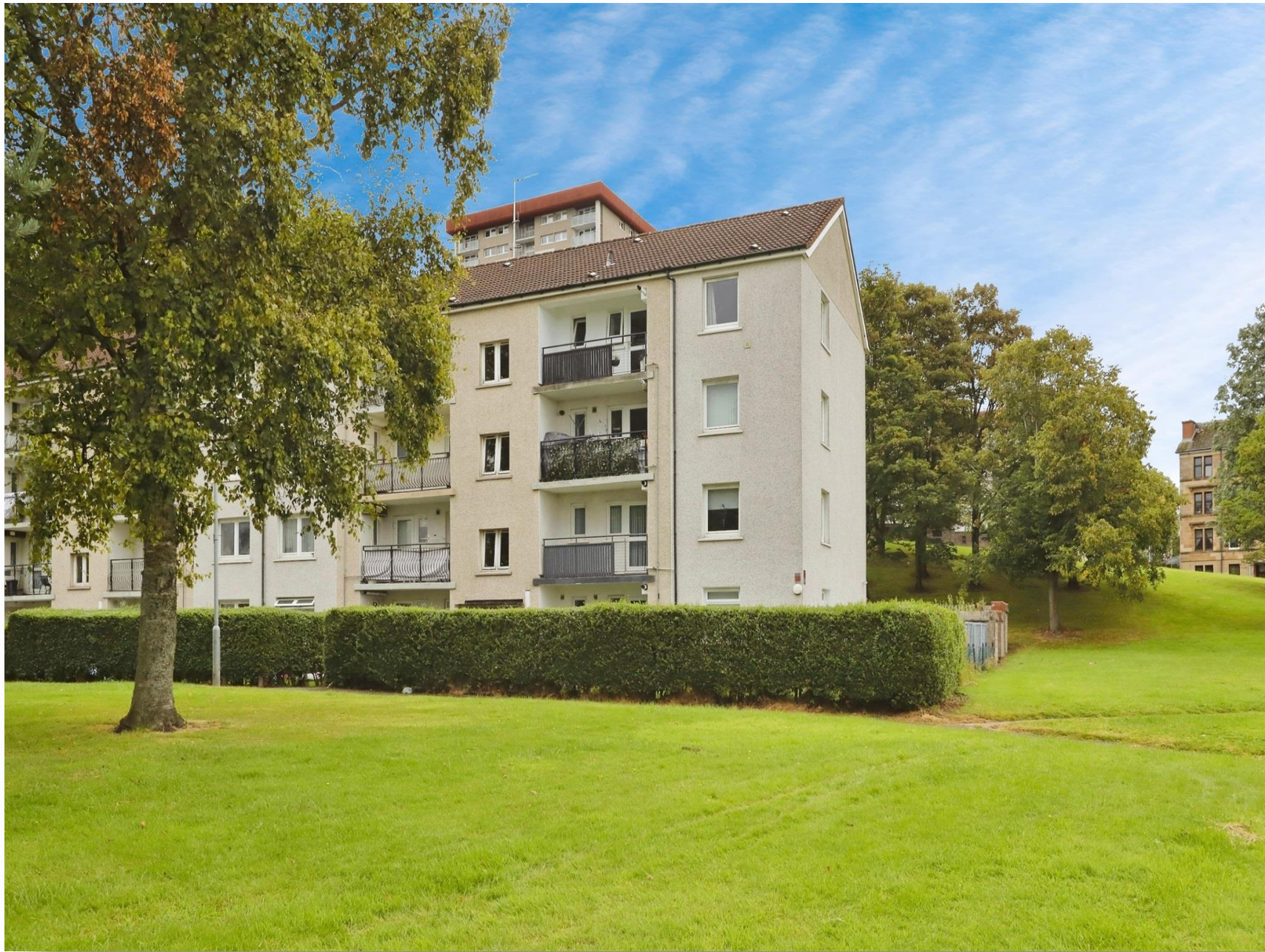
Carron Place, GLASGOW G22 6BN