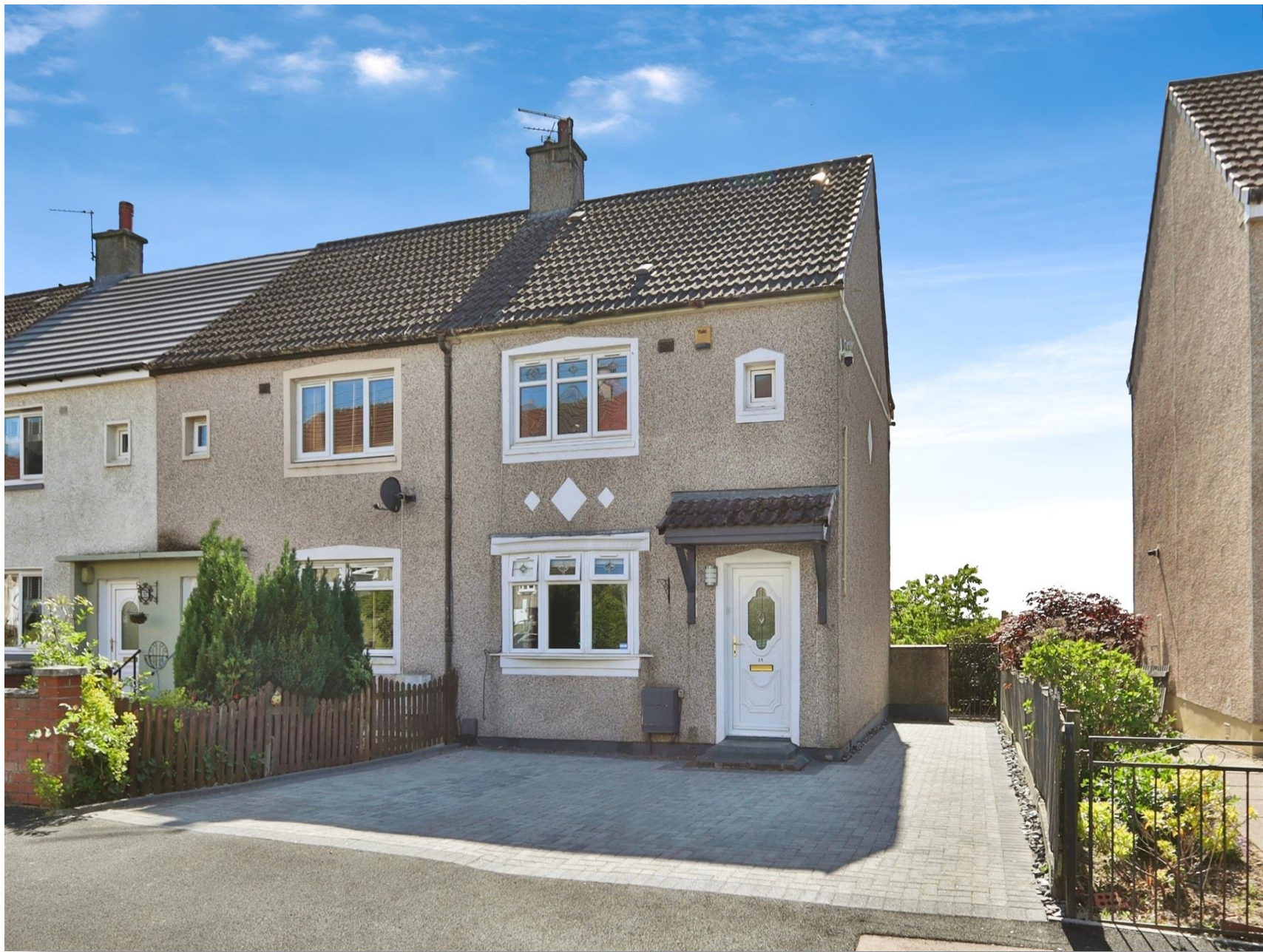
Northcroft Road, Chryston GLASGOW G69 0DW