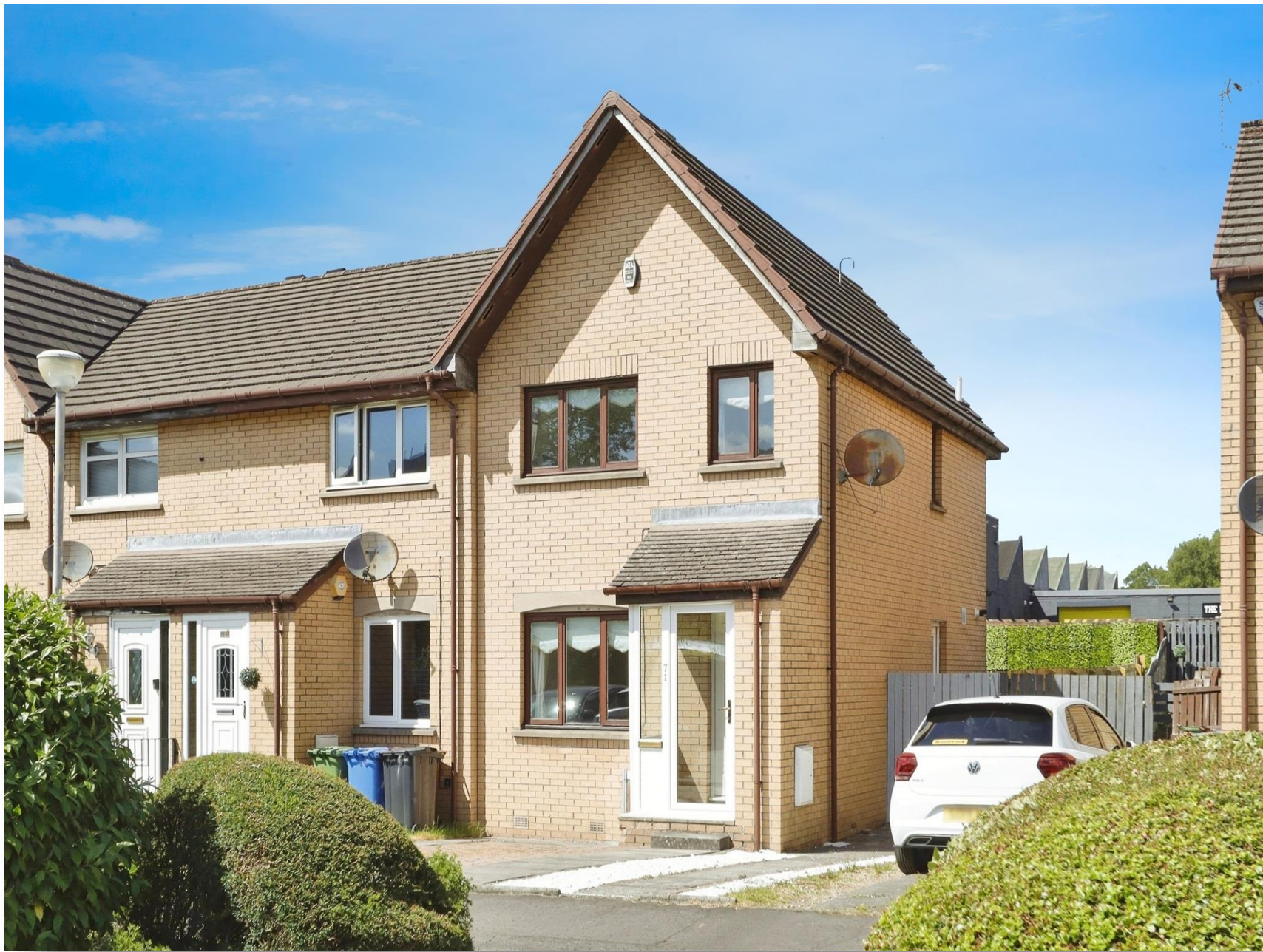
Southview Terrace, Bishopbriggs Glasgow G64 1SA